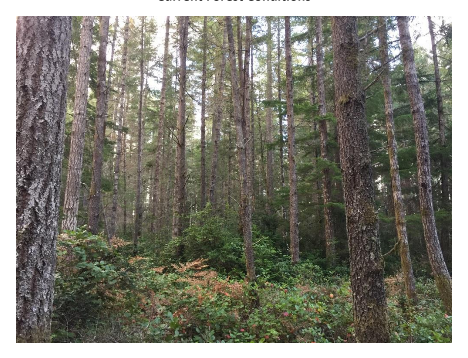
Typical Overstocked Douglas fir Stand