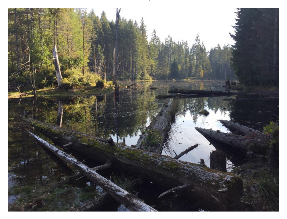
Park pond located between McCormick Woods and Camp Calvinwood