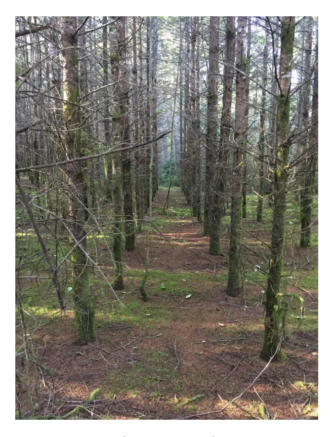
Former Christmas tree Plantation