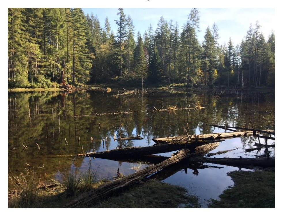
View across pond at Camp Calvinwood