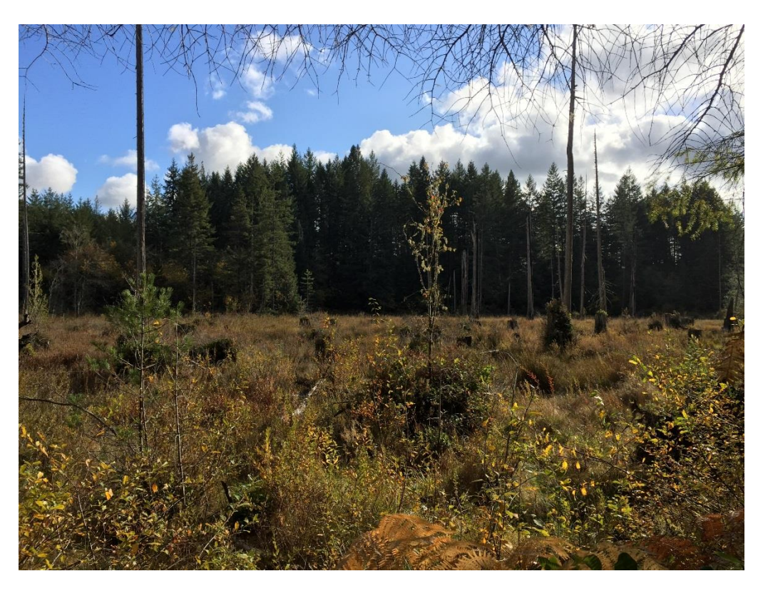
Class A Wetland with Coulter Creek Stream Channel