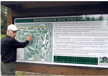
SUMMER COURSE LAYOUT