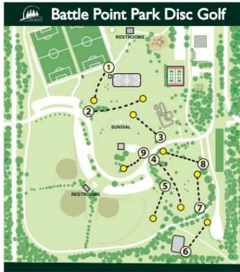
Info: bainbridgediscgolf2017@gmail.com For tournament or event use contact B! Parks: (206)842-2306 Visit us on Facebook: Bainbridge Disc Golf Club West Sound Disc Golf Association: wsgda.org