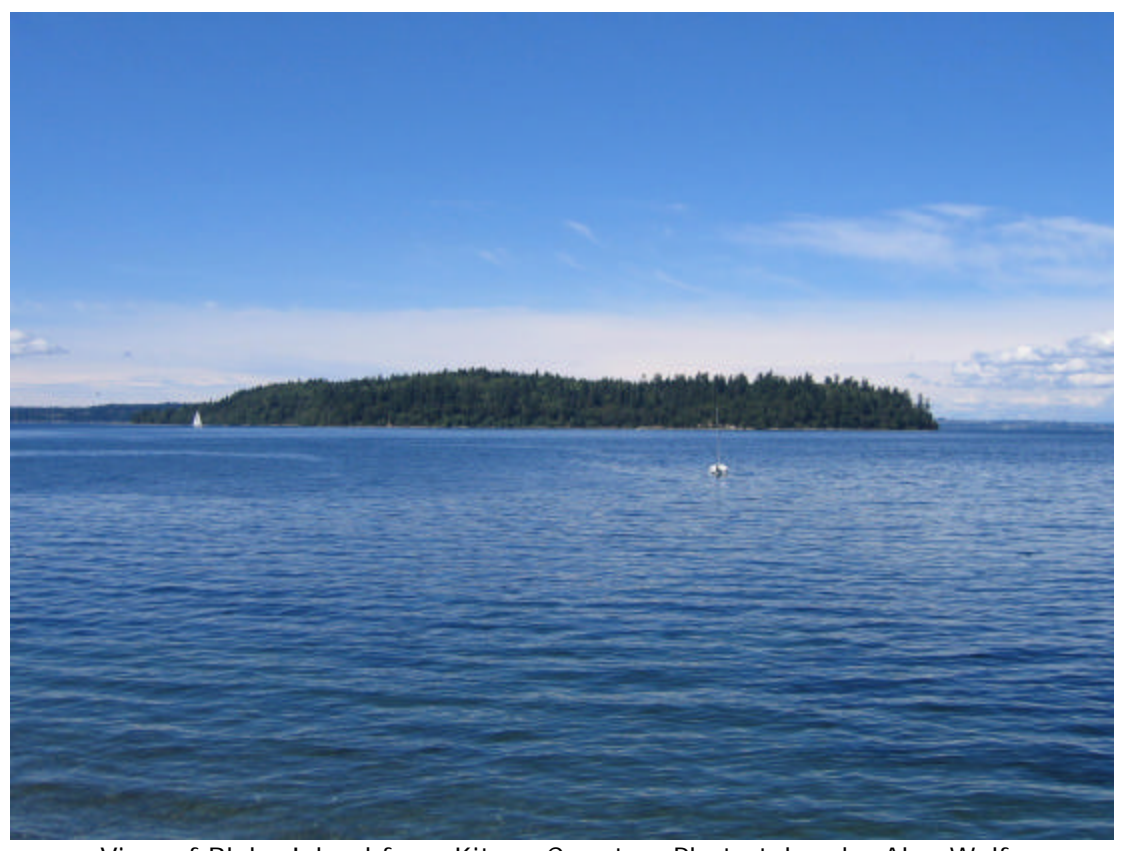
View of Blake Island from Kitsap County