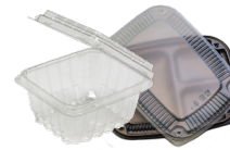
Plastic trays and clamshells

These items are not accepted for curbside or facility recycling