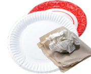
Paper towels, napkins, and plates