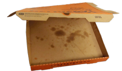
Greasy pizza boxes