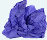
Tissue paper and cellophane