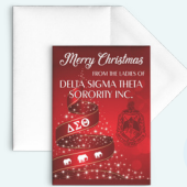
Plain cards and envelopes (no foil, glitter, batteries)