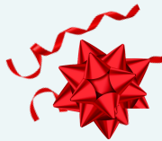
Bows and ribbons*