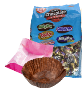
Candy wrappers and plastic bags