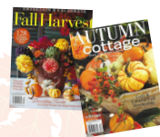
Magazines and catalogs