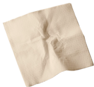
Paper towels and napkins