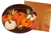
Paper and plastic serviceware