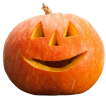
Jack-o-lanterns (no glitter or paint)

All food, yard waste, paper towels, napkins, and coffee filters can be placed in your curbside food and yard waste cart.