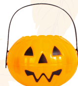
Plastic treat pails*