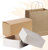
Plain gift boxes and bags (flattened)