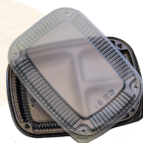
Plastic trays and lids