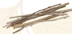
Branches (less than 3" in diameter and 4' long)