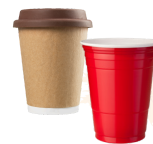
Paper and plastic cups