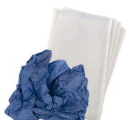
Tissue paper and cellophane