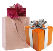
Fancy gift bags and stiff gift boxes*