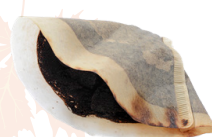
Coffee and filters