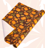
Plain gift wrap (flattened, no foil, glitter)

Remove bows, ribbons, and items with foils or glitter. Items must be clean and dry. Unsure what to recycle visit Recycle.Kitsap.Gov