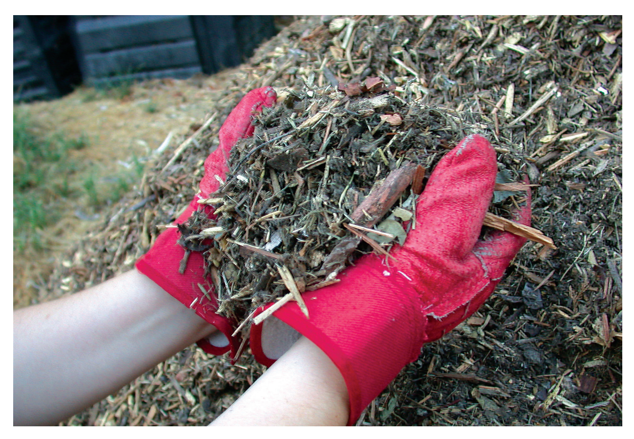
Mulch prevents weed growth and keeps soils moist

often you need to water. Mulch will keep plants' roots cooler as the weather heats up, benefitting plant health.