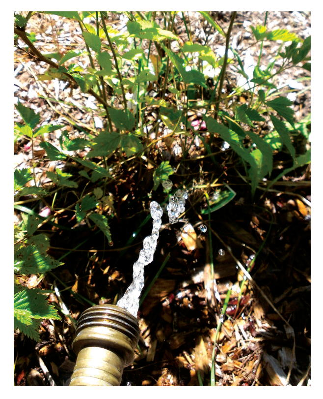
Watering the roots

Overwatering and light/infrequent watering should both be avoided because plants will