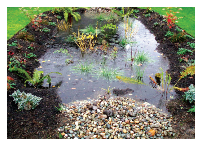
Some rain gardens will pond like this during rain events, others will drain as fast as they fill

Prune vegetation to maintain visibility for safety. Keep shrubs below 2 feet near roadways and driveways.