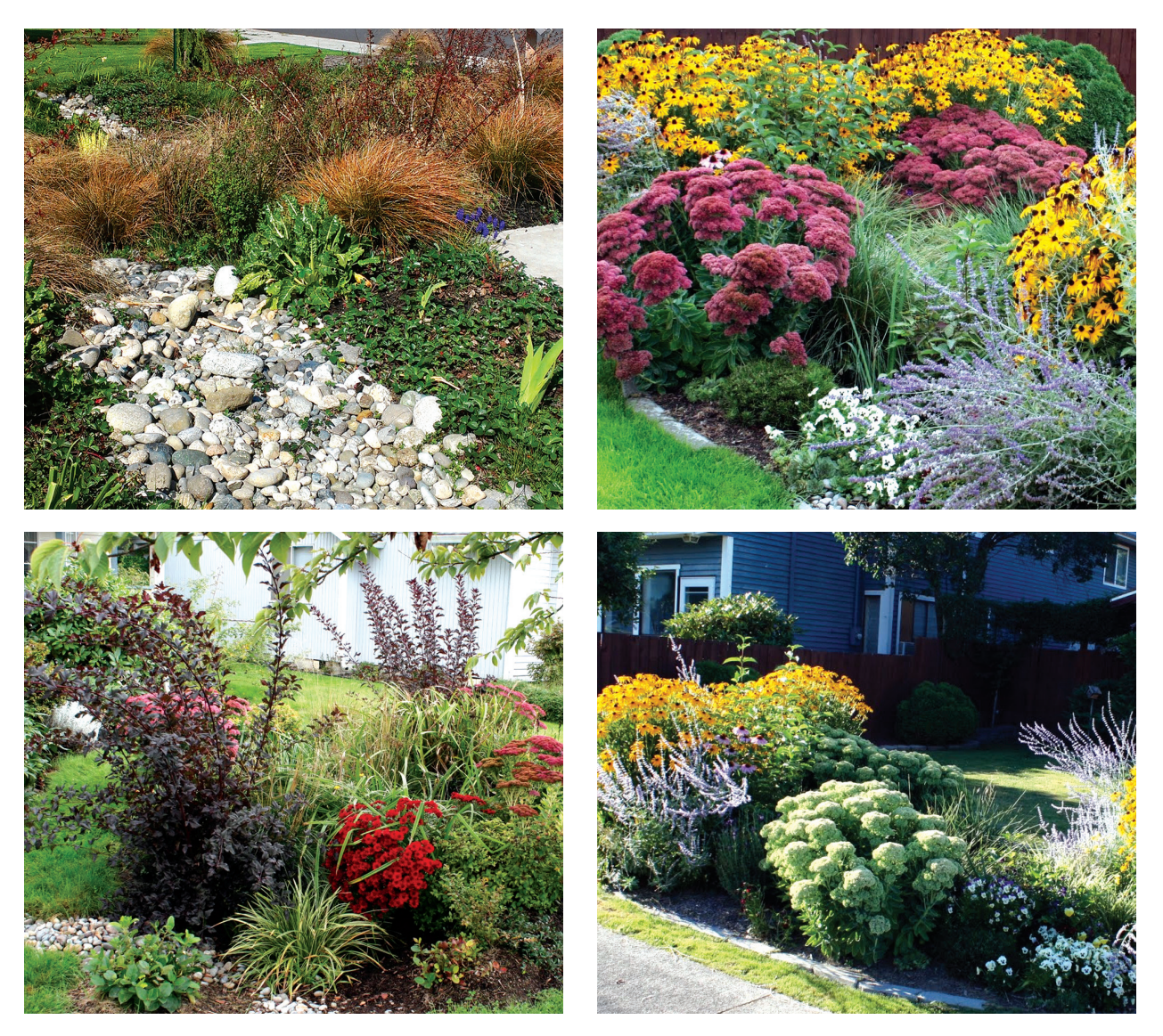
A well-maintained rain garden will reflect your style and taste