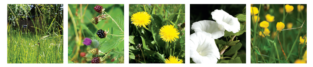
From left: Grass from lawns, Himalayan Blackberry, Dandelion, Morning Glory (Bindweed) and Buttercup

In Western Washington, you will most likely see Dandelions, Himalayan Blackberry, Morning Glory (also known as Bindweed), grass from lawns, and Buttercup in your rain garden.