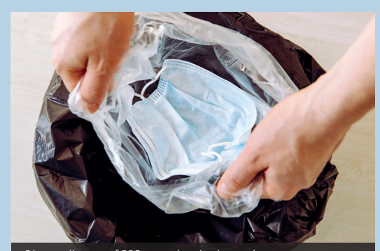
Always dispose of PPE properly - in the trash - to protect