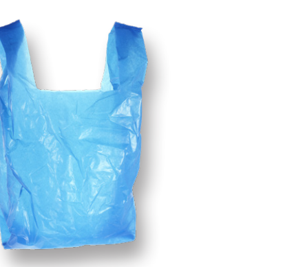
Plastic Bags Batteries and Wrap