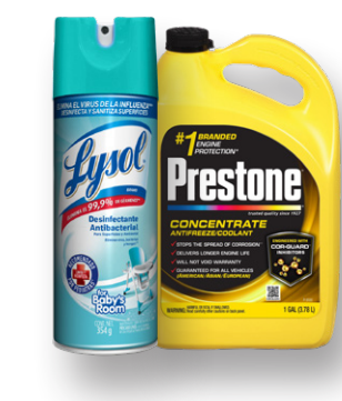
Household Hazardous Waste