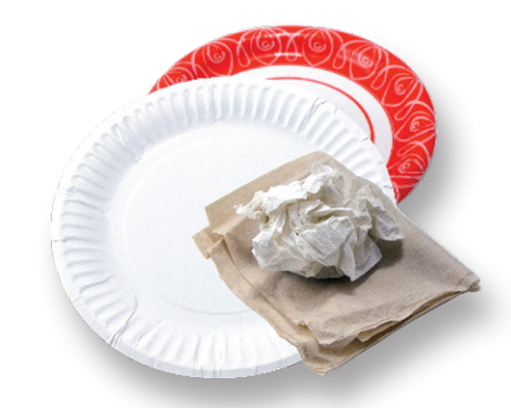
Paper Towels, Napkins and Plates