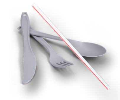
Utensils and Straws