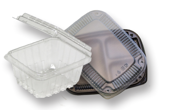
Plastic Trays and Clamshells