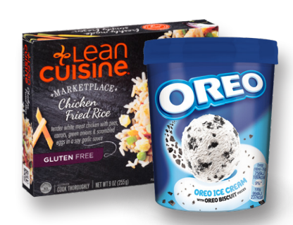
Frozen Food Containers