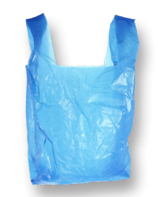
Plastic Bags and Wrap

Special drop-off sites for these items plus electronics, appliances, yard waste and more