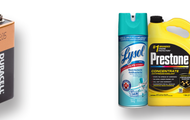
Household Hazardous Waste