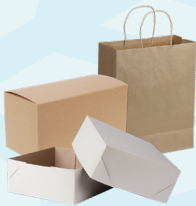
Plain gift boxes and bags (flattened)