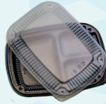
Plastic trays and lids