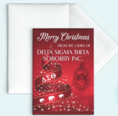
Plain cards and envelopes (no foil, glitter, batteries)