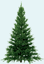
Fresh cut trees

Find recycle locations for these items and more at Recycle.Kitsap.Gov