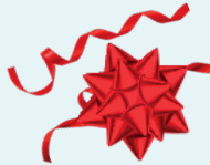
Bows and ribbons*