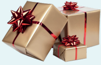
Fancy gift wrap (foil, glitter, etc.)