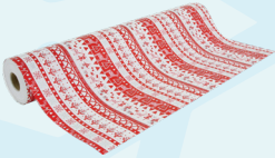
Plain gift wrap (flattened, no foil, glitter)

Remove bows, ribbons, and items with foils or glitter. If unsure, ask an attendant.