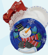
Paper plates, towels, and napkins