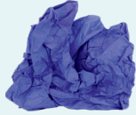
Tissue paper and cellophane