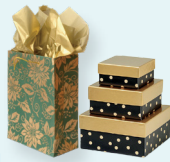
Fancy gift bags and stiff gift boxes*