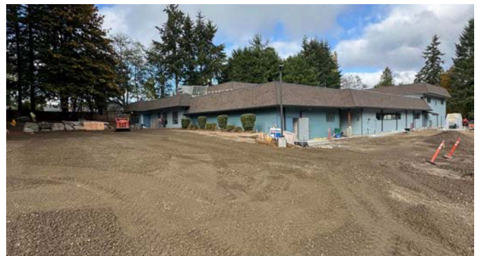
Grading and compaction for the parking lots