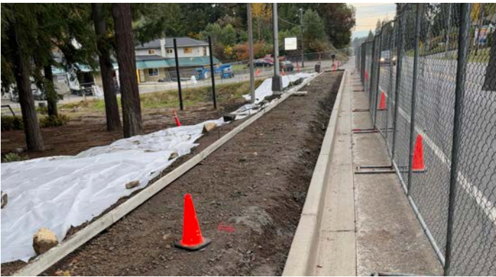
Concrete poured for the curb and gutter at the right of way

At the south end of the site, the sewer force main was tied into the existing sewer system. Work on the right of way continued and concrete was poured for gutters and curbs. Coordination with Puget Sound Energy continued, and the power cutover for permanent power and the new meter installation was completed. Surveyors staked out elevations and locations for the parking lots at the facility's south and east sides, where grading and compaction occurred. The installation of fences began at the north end of the facility with holes excavated for fence posts, and concrete was poured, securing the posts in place. The installation of toilets, sinks, and bathroom partitions began in the bathrooms and kitchen. Ductwork was installed for the HVAC units, and start-up for the three HVAC units on the roof occurred. The installation of flex ducts, grilles, and diffusers continued in the ceilings. Electrical trim-out continued, and light fixtures, receptacles, and light switches were installed throughout the facility. Door slabs, strikes, and closers were installed throughout the facility. Vinyl flooring was completed in kennels, pet care, the kitchen, and the laundry room. Exterior and interior painting reached completion.