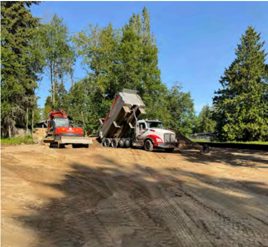
Grading for sidewalk, picnic area, and children's playground

Installation of heating, cooling ductwork, and electrical rough-in are on schedule. Inspections will take place for framing, plumbing, electrical work that is completed. Scheduling for installation of drywall and insulation is underway. Delivery and installation of replacement doors and windows is also scheduled. Fire sprinkler assembly continues to progress throughout the facility. Preparations are underway for concrete pours for sidewalks, a picnic area, and stairway on the north property. Coordination with utilities on site for upgrades and connections. Utilities include Puget Sound Energy, West Sound Utility District, and Cascade Natural Gas.