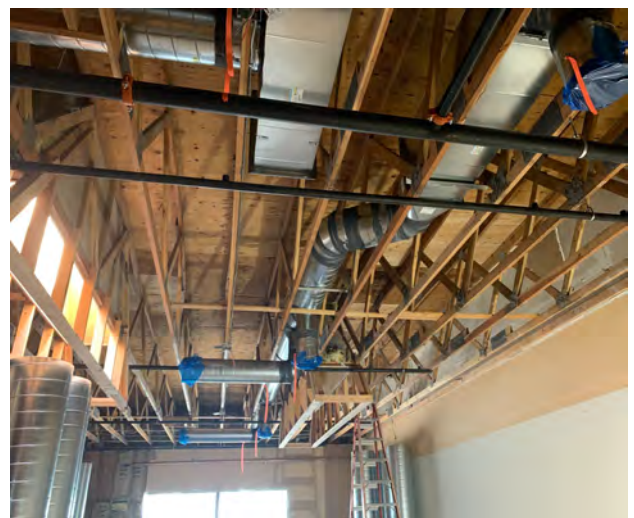
Installed ductwork and fire sprinkler system