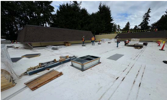
Completed Roof Vent Installation