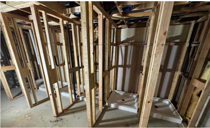
Completed Shower Pan Installation

There is a lot of excavation on the site. Coordination with Puget Sound Energy continued as the electrical vault located on the southeast end of the property was set in place. New conduit was installed underground to provide power to the facility. Two fire hydrants were installed on site and grading will continue. The fire service vault and fire department connection are 85% complete. Exterior window replacement reached 95% completion. Lap siding installation is 60% complete. The retaining wall on the north end was constructed. New yard drains were installed. Vents were installed in the roof and the roofing project is complete. Low-voltage wiring was run for smoke detectors and interior lighting. The rough-in plumbing for sanitary sewer and water distribution was completed. The insulation of plumbing pipelines are 50% complete. Soffit lighting was replaced. Shower pans were set and installed in all shower areas. Framing, plumbing, electrical, and mechanical inspections were scheduled and passed. Framing was approved which allows for the installation of insulation and drywall. The HVAC installation will be finalized with the delivery of rooftop units in August.