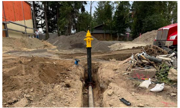
Completed Fire Hydrant Installation