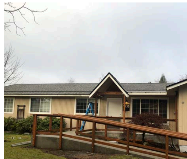
Foundation for the Challenged - acquisition and rehabilitation of a 3-bedroom home for adults with developmental disabilities.

The 2016-2020 Consolidated Plan prioritized affordable housing - a total of $6,938,179 was invested.