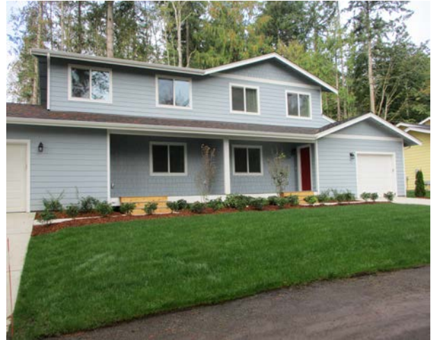
YWCA Morrow Manor - 8 new units of rental housing for survivors of domestic violence and their families.