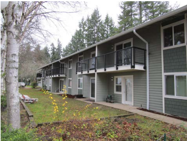
Conifer Ridge Apartments - 40 units of rental housing rehabilitated for senior adults.

The 2016-2020 Consolidated Plan prioritized affordable housing - a total of $6,938,179 was invested.