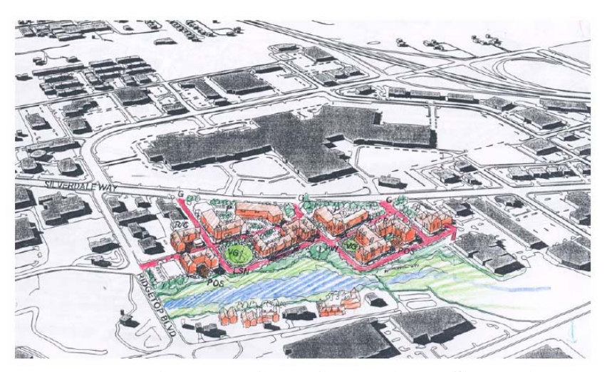
Figure 5-2 Clear Creek Village Site Design Example

Clear Creek Village will be a new and central neighborhood or village composed of a series of interconnected mixed-use developments along the west side and immediate east side of Clear Creek riparian area. The village will include residential, commercial and office uses arranged around village squares, connected by continuous pedestrian walkways and a local street network. New and reconfigured developments will use the Clear Creek corridor as an open space amenity and design feature. Residential uses will orient to the creek corridor, visually connecting private open space features with the creek corridor. Development within the village will be oriented toward a local street network. See Figure 5-1 Clear Creek Village Site Design Example and 5-3 Clear Creek Village Streetscape Example .