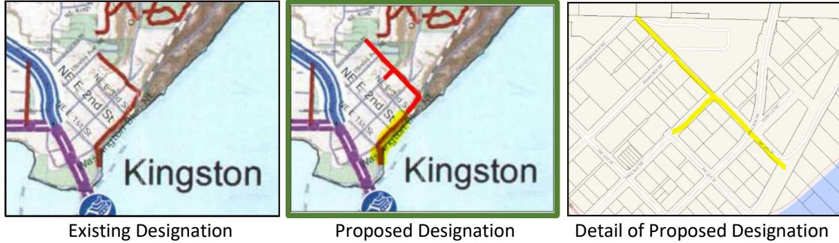
Figure 1 - NMP Report Map

The NMP item #2(N5) on page 15 of the Staff Report proposes to extend a small area between Pennsylvania Avenue and Illinois Ave. and identify trail as a “Existing Open Trail” (see Figure 1 below) .