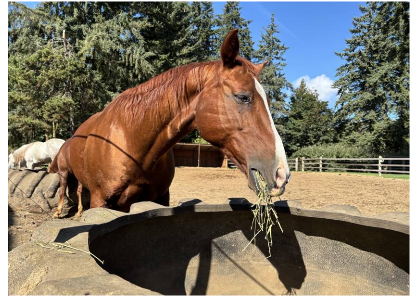
Bainbridge Island Review: A chestnut horse grazes on hay at Lazy K Stables

Assess alignment with existing county code and permitting frameworks