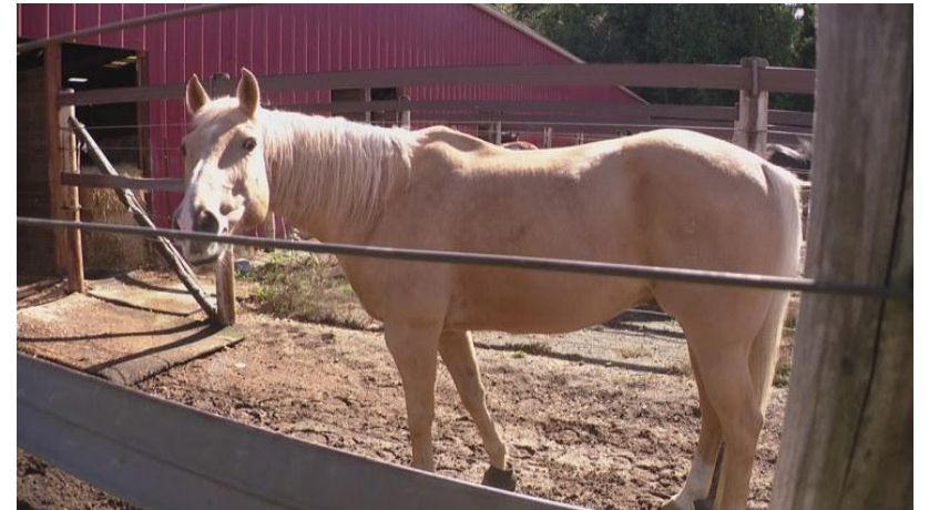
King 5 and Kitsap Sun