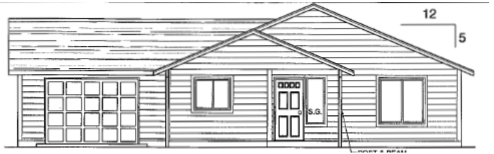
Figure 2 ADU Elevation

h. All setback requirements for the zone in which the ADU is located shall apply;