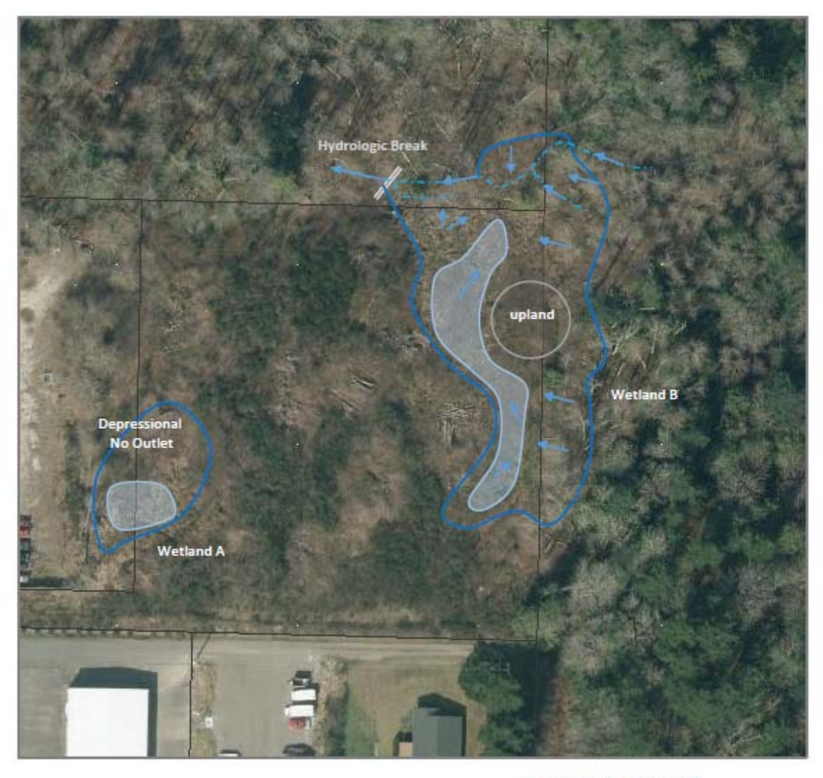
Figure 2. Hydroperiods Wetland A and Wetland Unit B Seasonal inundation (shaded)

ALL SECURE SELF STORAGE 6000 Block State Highway 303 NE Bremerton WA