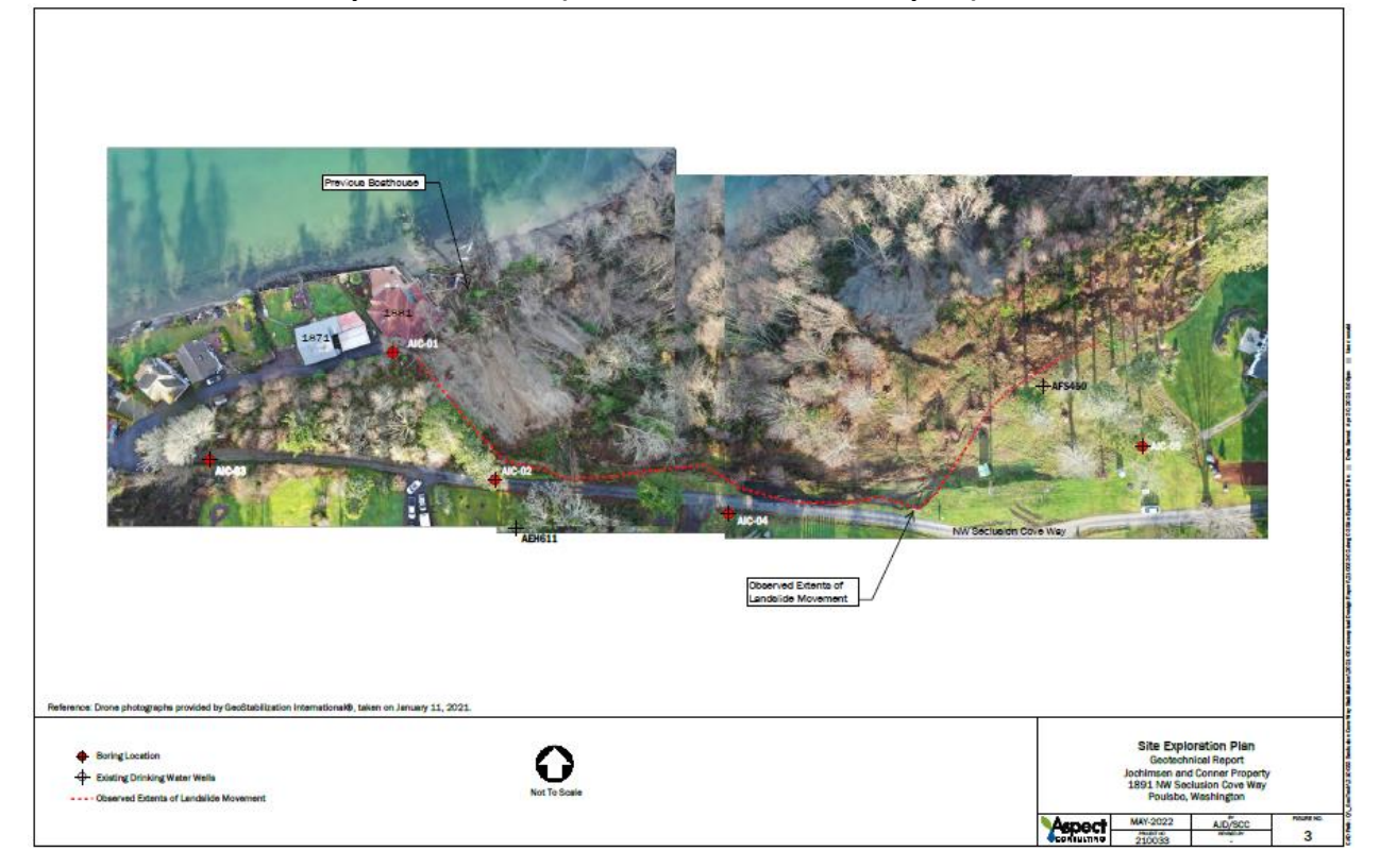
Attachment D – Site Exploration Plan (source - Geotechnical report)

Attachment C – Washington State Department of Ecology Shoreline Photo