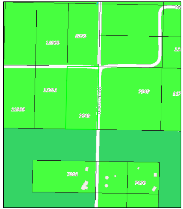
Attachment A - Zoning Map

Surrounding: Rural Residential (RR) and Rural Wooded (RW)