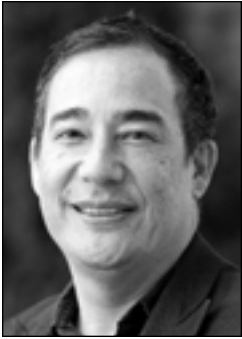
Steve Hobbs (Prefers Democratic Party)

Elected Experience: Secretary of State Steve Hobbs will ensure every eligible Washingtonian’s voice is heard in secure, accessible elections. In the state Senate, Hobbs chaired the Transportation Committee and earned a reputation as a champion of bipartisan solutions.