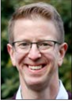
Derek Kilmer (Prefers Democratic Party)

Elected Experience: U.S. Representative: 2013-Present, Appropriations Committee; Chair, Select Committee on Modernization of Congress; Cochair, Bipartisan Working Group; AMVETS Silver Helmet Award for supporting veterans; U.S. Navy's Distinguished Public Service Award; Bipartisan Policy Center Award for bipartisan problem solving; NPCA Friend of the National Parks;