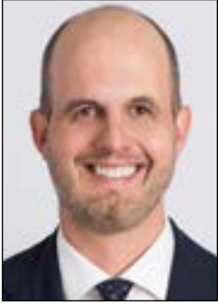
Drew Hansen (Prefers Democratic Party)

Elected Experience: Washington House of Representatives 2011-present (Chair, Civil Rights and Judiciary Committee)