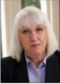
Patty Murray (Prefers Democratic Party)

Elected Experience: Shoreline School Board, State Senator, United States Senator